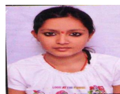
Aarzoo 83.67%, 1st in College