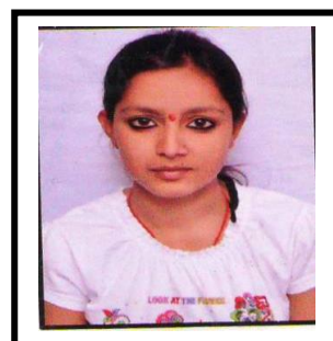
Aarzoo 83.67%, 8th in PU, B.COM 3rd Sem