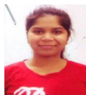
Shilvi 81%, 1st in College