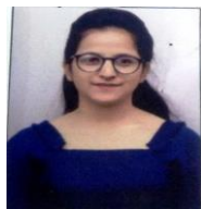
Rimpay 84.25%, 2nd in College