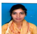
Ekta 77%, 1st in College